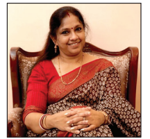
Message from The Co- Chairman Page 2